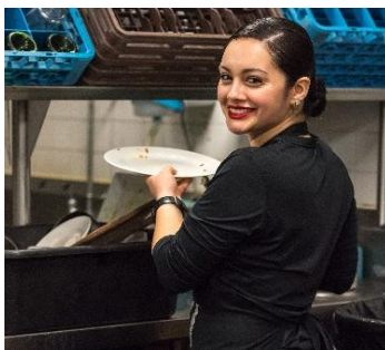
Touching dirty dishes or equipment