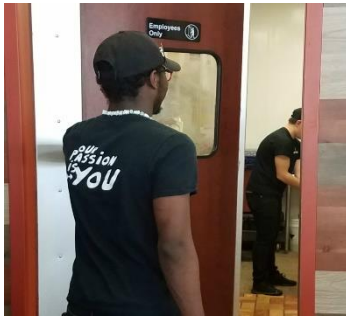
Working with food