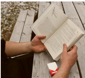
Smoking or taking a break