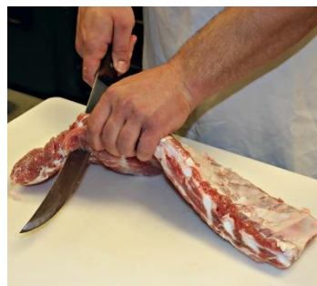
Touching raw meat or eggs