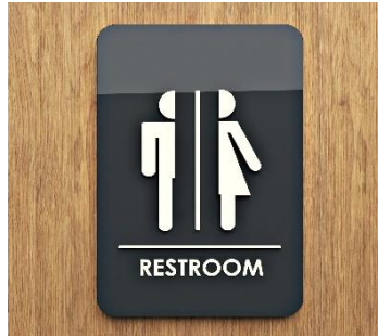
Using the restroom