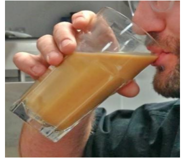
Eating or drinking