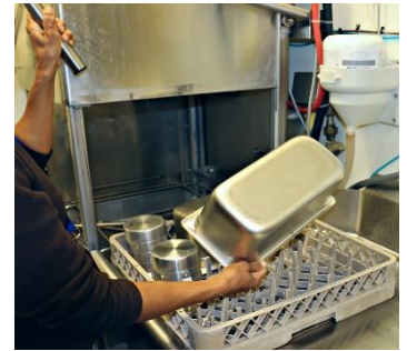
Touching clean dishes