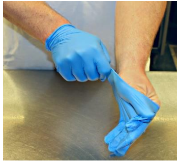
Putting on new gloves