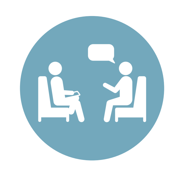
Access to Mental Health Care

The steering committee selected these priorities (see box to left) which all affect our health. The team and community partners will develop goals, objectives, and indicators for each priority.