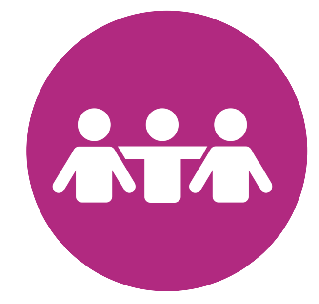
Racial Diversity & Inclusion