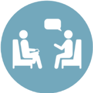
Access to Mental Health Care

The Steering Committee selected the following priorities. The CHA/CHIP team developed goals, objectives, and activities for each priority.