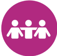
Racial Diversity & Inclusion