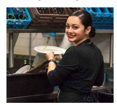
Touching dirty dishes or equipment