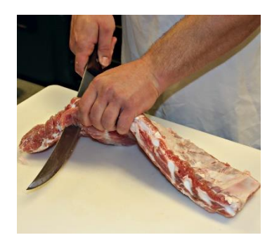
Touching raw meat or eggs