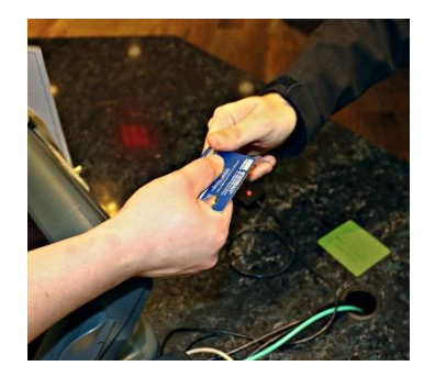
Touching money or cash register