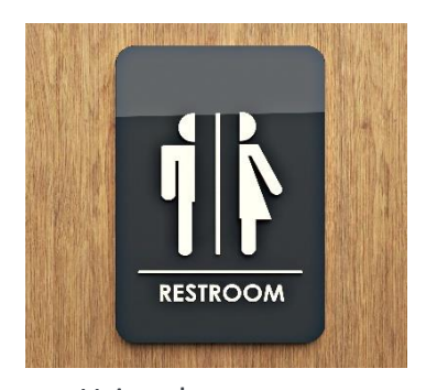
Using the restroom