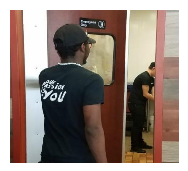
Working with food