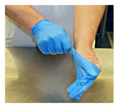
Putting on new gloves