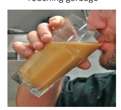
Eating or drinking