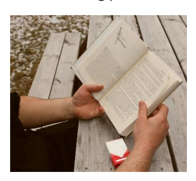
Smoking or taking a break