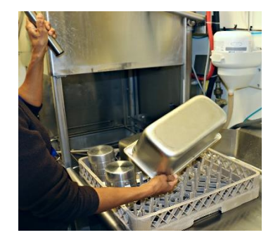
Touching clean dishes